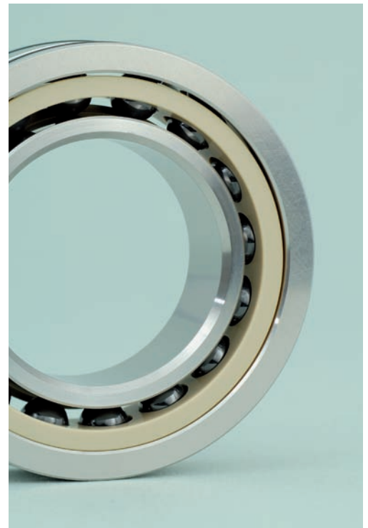
CEROBEAR hybrid spindle bearing for highest demands