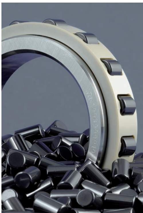
CEROBEAR roller bearing and silicon nitride rollers