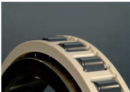
CEROBEAR hybrid spindle roller bearing - extract of a PEEK cage with rollers

This cage material used by CEROBEAR is characterised in particular by the following characteristics: