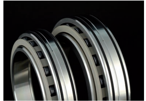
CEROBEAR hybrid spindle roller bearing for direct oil lubrication

One of these industries is the machine tool industry, with particularly high demands concerning concentricity, speed coefficient and stiffness. These demands are fulfilled by CEROBEAR rolling bearings to an extremely high degree.