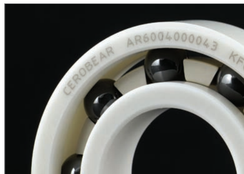
CEROBEAR ceramic deep groove ball bearing

The effects known from steel rolling bearings, such as smearing, cold welding and fretting are eliminated in the material coupling of ceramic/steel in hybrid rolling bearings and in pure ceramic rolling bearings. For these reasons, CEROBEAR bearings have ideal emergency running properties so that if the lubrication intake is temporarily disrupted, this is no problem for the bearing. Longer lifetimes and increased reliability are achieved as a result. The lifecycle costs in the application can be reduced.