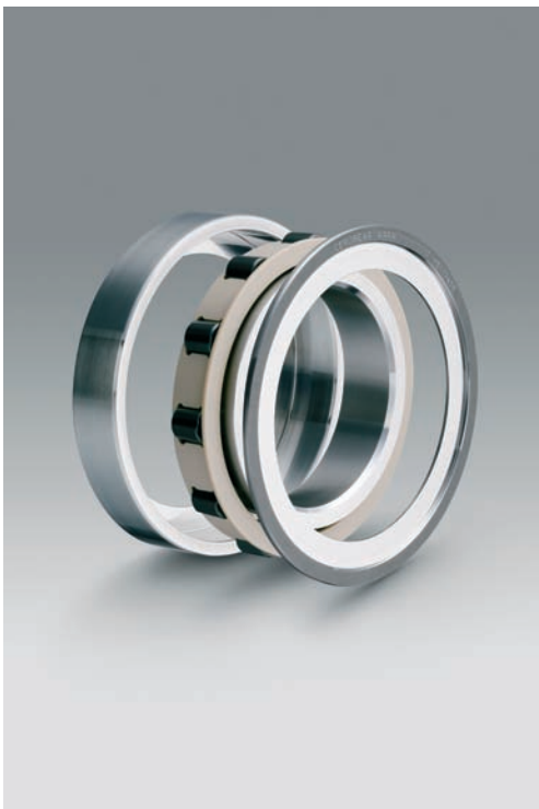
Shielded version of CEROBEAR hybrid spindle roller bearing

The material combination of ceramic/steel is superior to conventional steel bearings in many areas of rolling bearing technology. By using bearings with ceramic components higher revolutions and stiffnesses, reduced wear and lower heat development can be achieved.