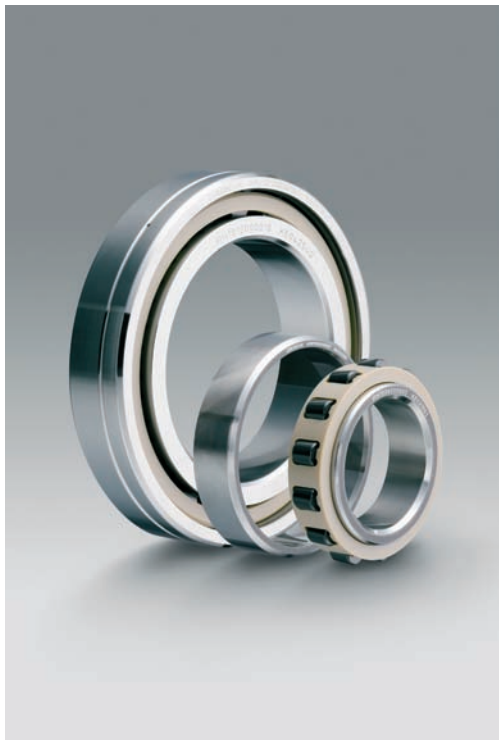
CEROBEAR hybrid spindle roller bearings in different sizes

This solution is primarily suitable for use in heavy duty machining, where high forces are created on the spindle at moderate rotational speeds due to the large material removal.