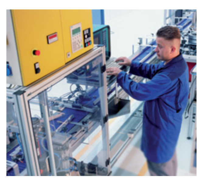
100% noise testing guarantees highest precision.