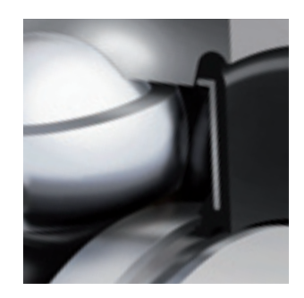
The newly developed NKE double-lip labyrinth seal