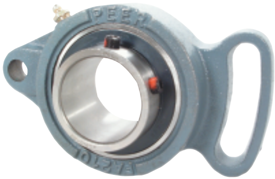
Adjustable Flange Units Cast iron UCFA series

PEER offers many options and modifications on flange units. In addition, PEER offers custom casted specials made to exact customer specifications. Below are just a few examples. Contact your sales representative for further information.