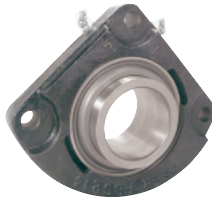
Special cast iron housings made for special customer applications