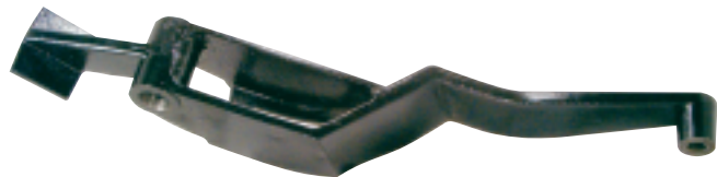
Ductile "ARM" designed for agricultural applications

Private labeling available See page 31 for pillow block specials