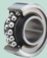
Standard type: ANTI-FRICTION BEARING