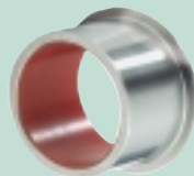
Standard type: JOURNAL BEARING