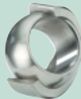
Standard type: PLAIN / SPHERICAL PLAIN BEARING