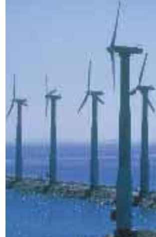
Solid Oil is useful in inaccessible positions.