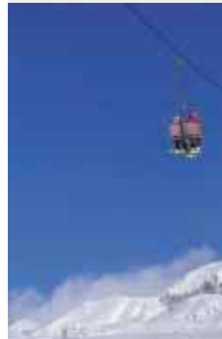
In a ski lift Solid Oil is appreciated. It does not leak oil on the passengers and in the cold it has much lower starting torque than grease, which saves energy.