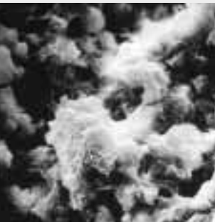
Millions of micro-pores retain the oil in Solid Oil.