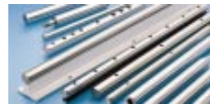
60 Case LinearRace