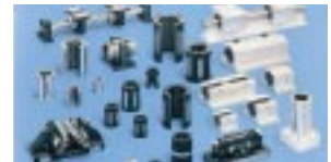
Ball Bushing Bearings and Components