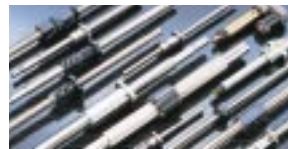
Saginaw and IBL Ball Screws