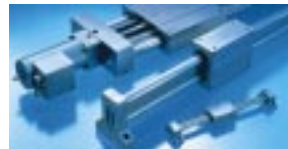
Linear Motion Systems

The Thomson Industries Group of Companies specializes in the invention, design, development and manufacture of linear Ball Bushing* bearings; Roundway* roller bearings; 60 Case* hardened-and-ground LinearRace* shafting; Thomson Saginaw* and IBL* ball screws and ball splines; pre-engineered, pre-assembled, ready-to-install RoundRail* systems; AccuGlide* linear ball bearing systems; AccuMax* linear roller bearing systems; Nyliner* engineered-polymer bearings; precision bearing balls; and related accessories. Thomson Micron is an innovative designer and manufacturer of precision True Planetary* gearheads and position feedback transducers. Thomson products are used worldwide in the automotive, aerospace, machine tool, machinery and equipment, process control, robotics, automated assembly, material handling, packaging, medical and recreational industries.