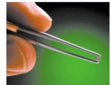
Ceramic bearings continue to grow in popularity. Timken ceramic bearing customers report enhanced performance, reliability and bearing life with our designs.