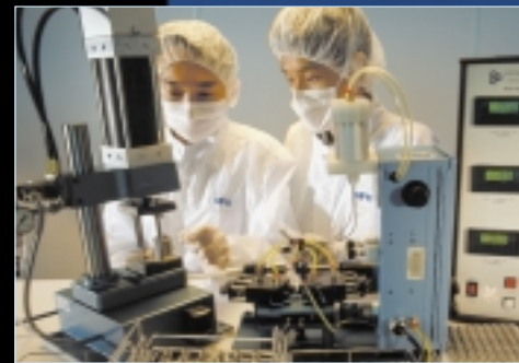
Bearings have been attractive applications for engineered ceramics because of these materials' overall superior quality.

Timken® ceramic bearings reduce wear and extend life.