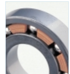
The lower-density silicon nitride significantly reduces the centrifugal forces of the balls on the outer ring.

In corrosive atmospheres - including pumps, meters and semiconductor applications -